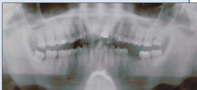
Figure 1: Preoperative panoramic radiograph showing advanced periodontal bone loss.

weeks after a combined periodontal and oral surgery procedure.